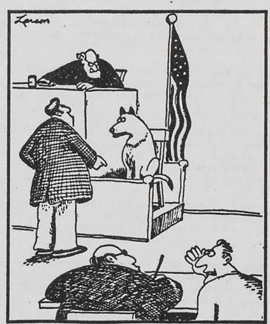
"I could have guessed ... my friends all warned me that this breed will sometimes turn on you."